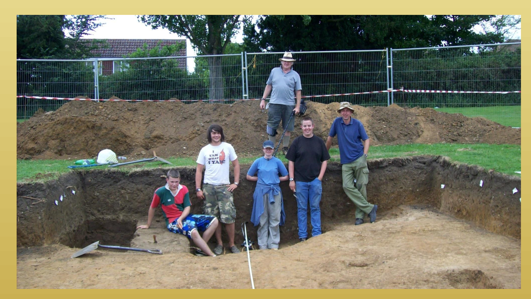
Job well done! And just time for a team photo before the machine returns to backfill.