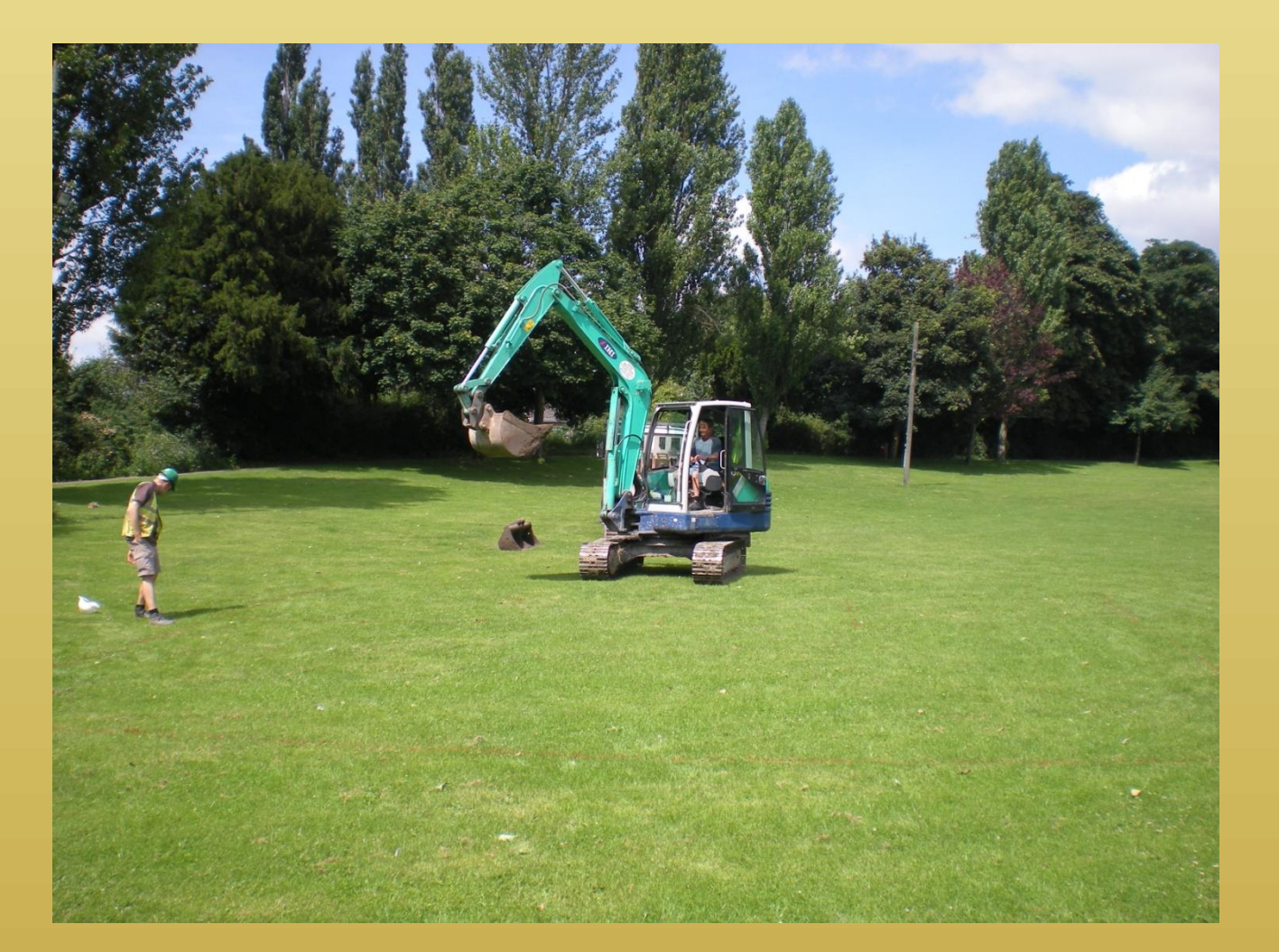
The machine and driver arrive to start opening up the site, its location selected on the basis of geophysical survey at Easter.