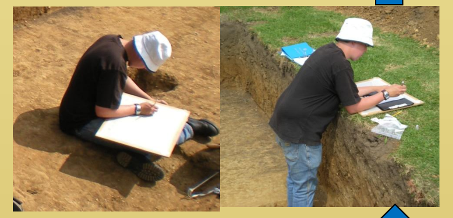
Recording features on to plans and context sheets