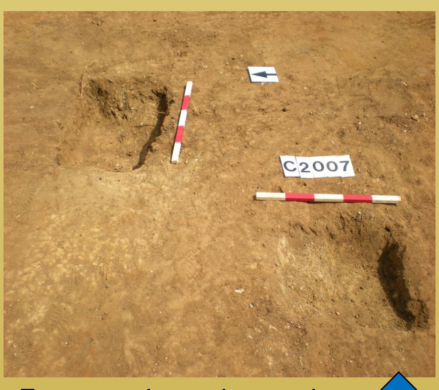
Features cleaned up and ready to be recorded.