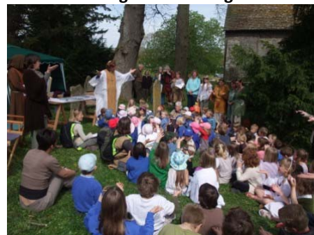
Figure 10: Welcoming the youngest friends of Corhampton Saxon Church