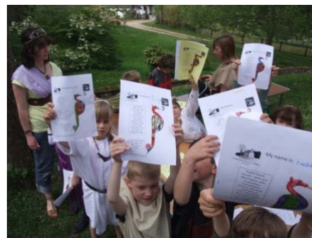
Figure 6: Illustrating Saxon books