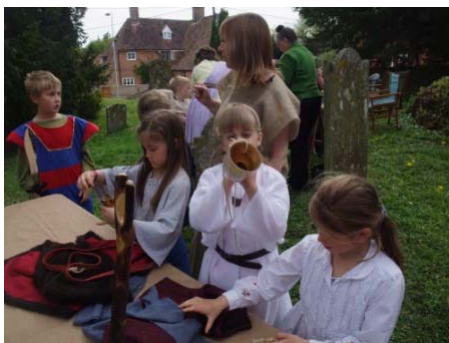
Figure 1: Children dressing as Saxons