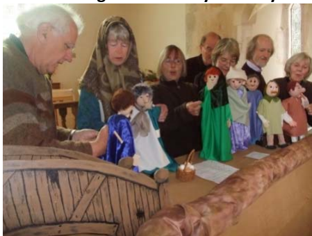
Figure 3: The Riverside Players and their Saxon puppets