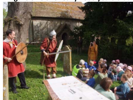
Figure 9: Re-enacting the battles of Stamford Bridge and Hastings