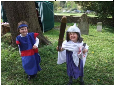
Figure 4: Ready to fight the Norman invaders