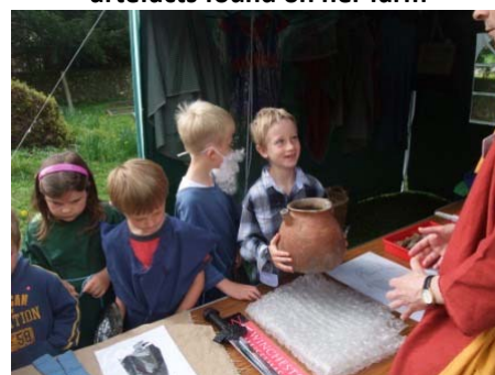
Figure 8: Is this really 1000 years old?