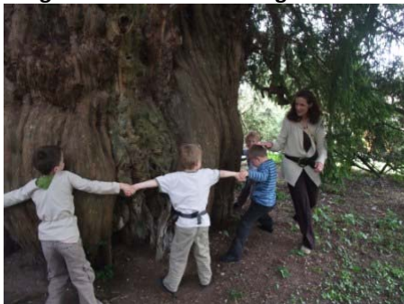
Figure 2: How big IS this 1000 year old yew tree?