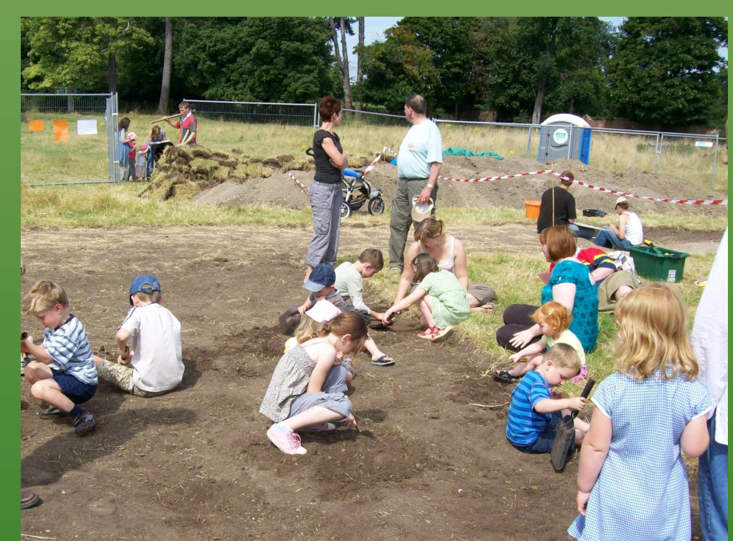
Here an area of topsoil is used for a children's excavationarchaeologists of the future perhaps?

The 2008-2010 Project is funded by the Arts and Humanities Research Council and is a joint academic venture between the archaeology departments of the Universities of Leicester, Exeter and Oxford. The project is run in collaboration with Wallingford Museum and The Wallingford Historical and Archaeological Society (TWHAS), and is supported by Wallingford Town Council, South Oxfordshire District Council, Oxfordshire County Archaeology Service, English Heritage, the Northmoor Trust, the Ashmolean Museum and Reading Museum.