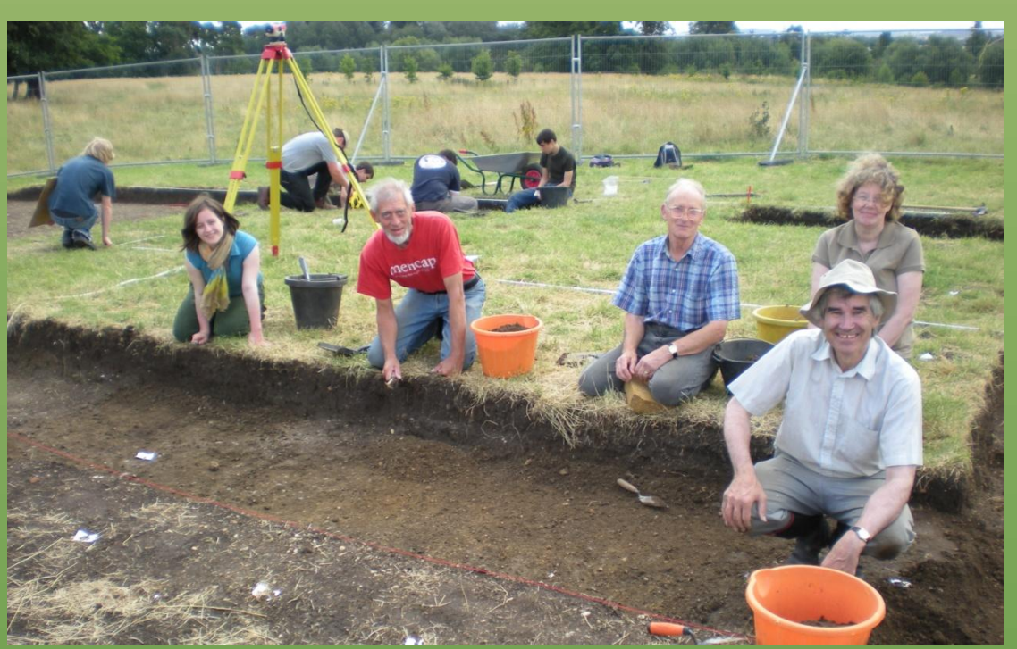
TWHAS volunteers glad of a break from trowelling.