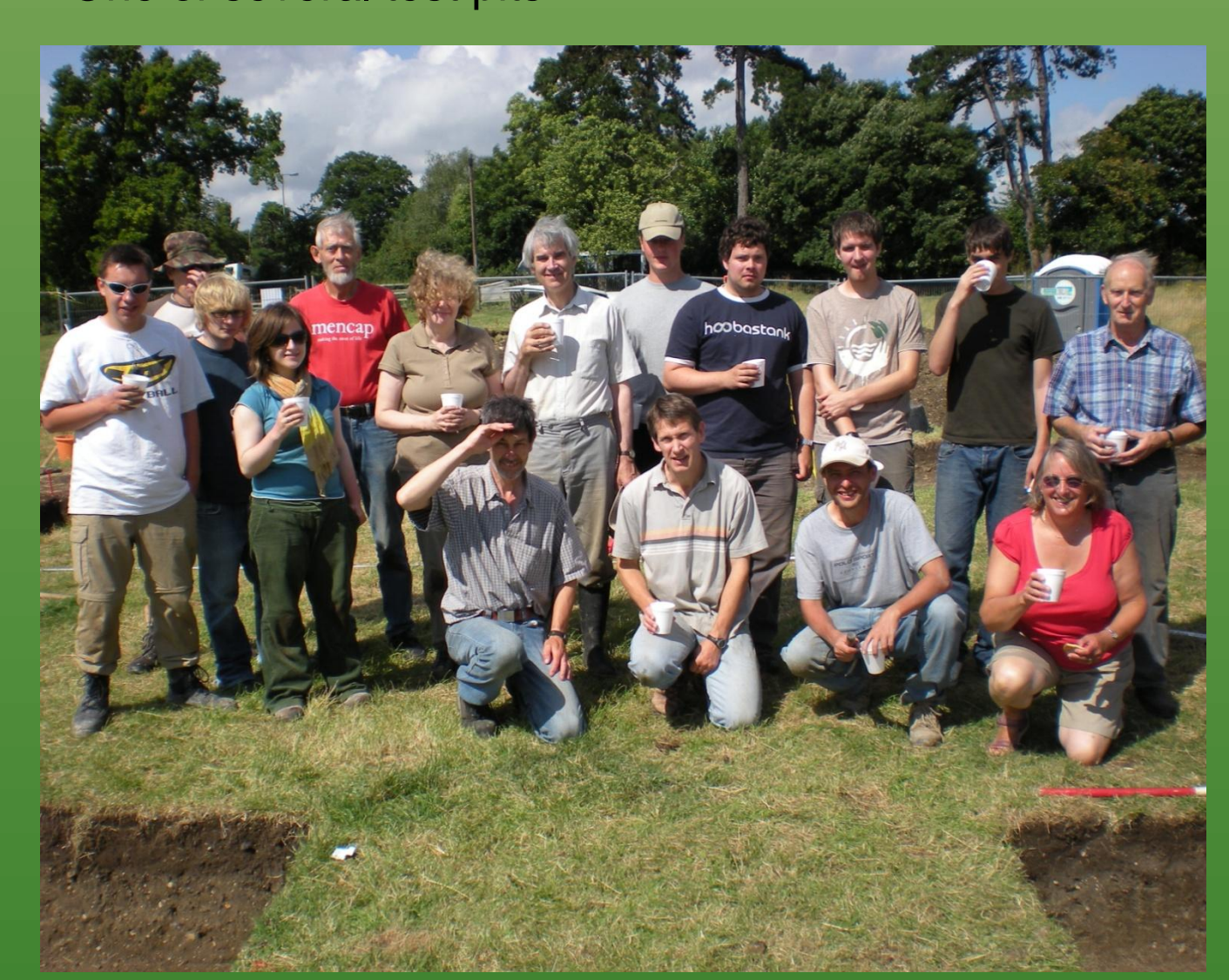
Students, volunteers, academics, museum workers – and their cups of tea!