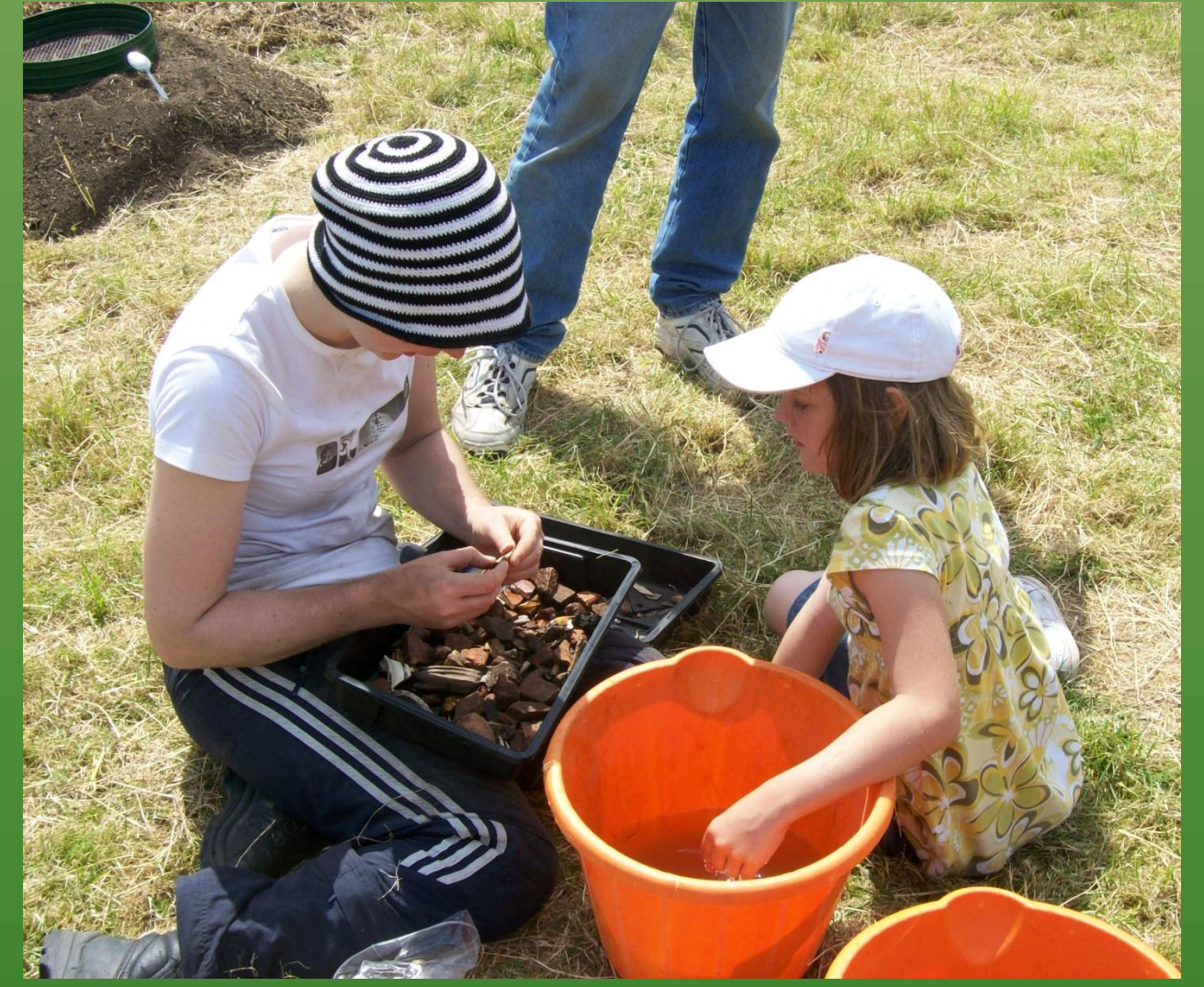
What community archaeology is all about.