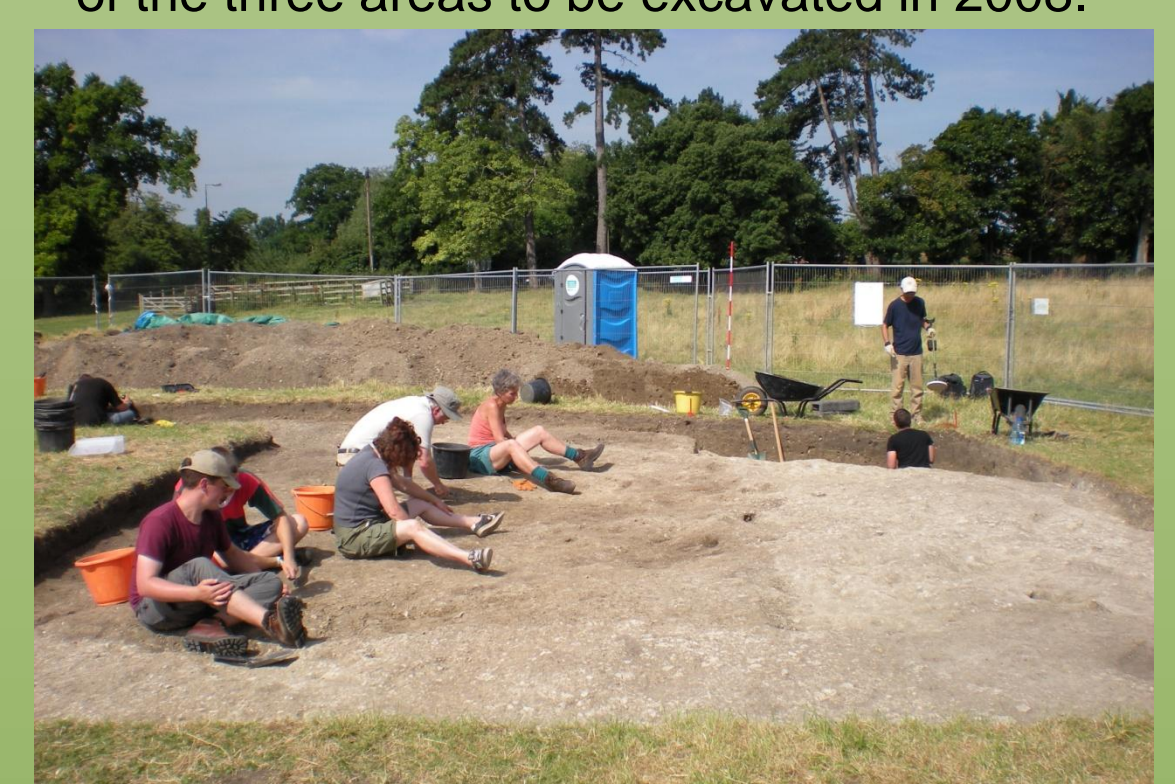
Trowelling the silt-clay surface of the platform.