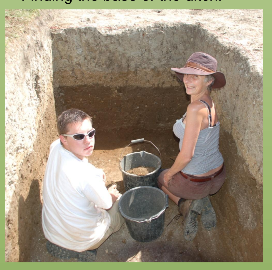
Digging through the platform.