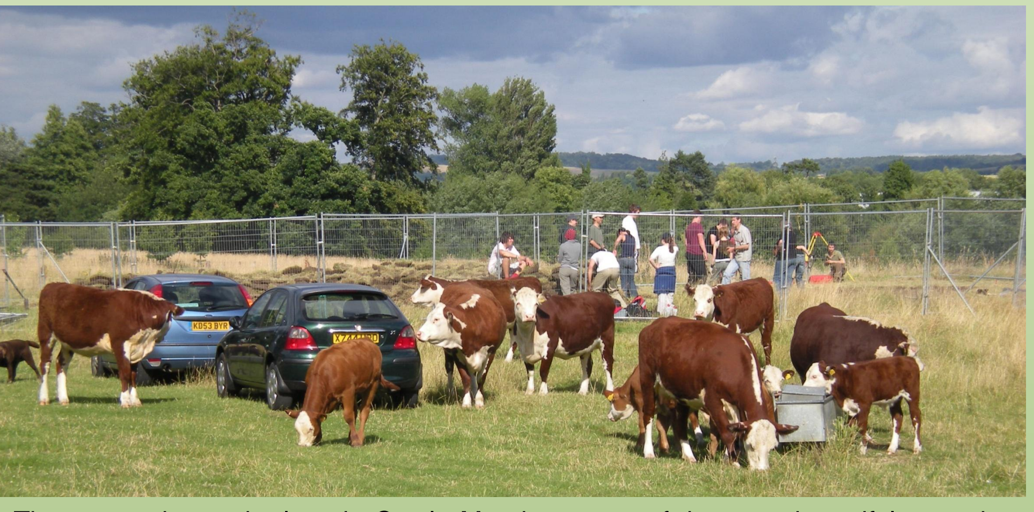
The excavation took place in Castle Meadows, one of the most beautiful spots in Oxfordshire. Looked after by the Northmoor Trust, the meadows contain the earthworks of Wallingford Castle – destroyed after a long siege by the Parliamentarian army in the English Civil War.