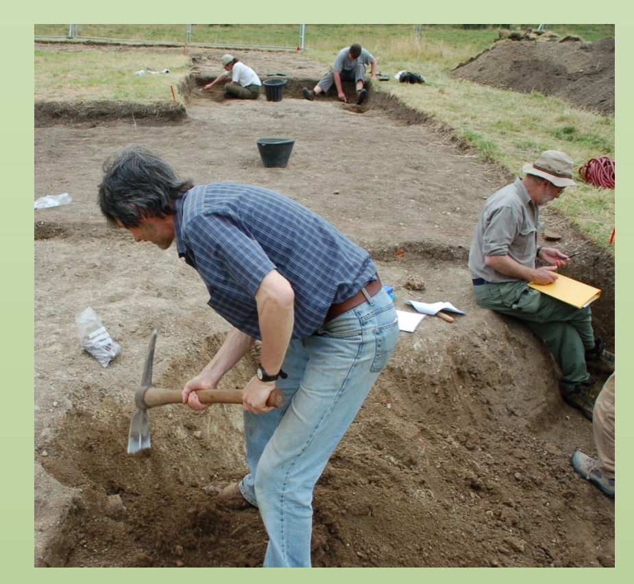
Finding the edge of the outer ditch.