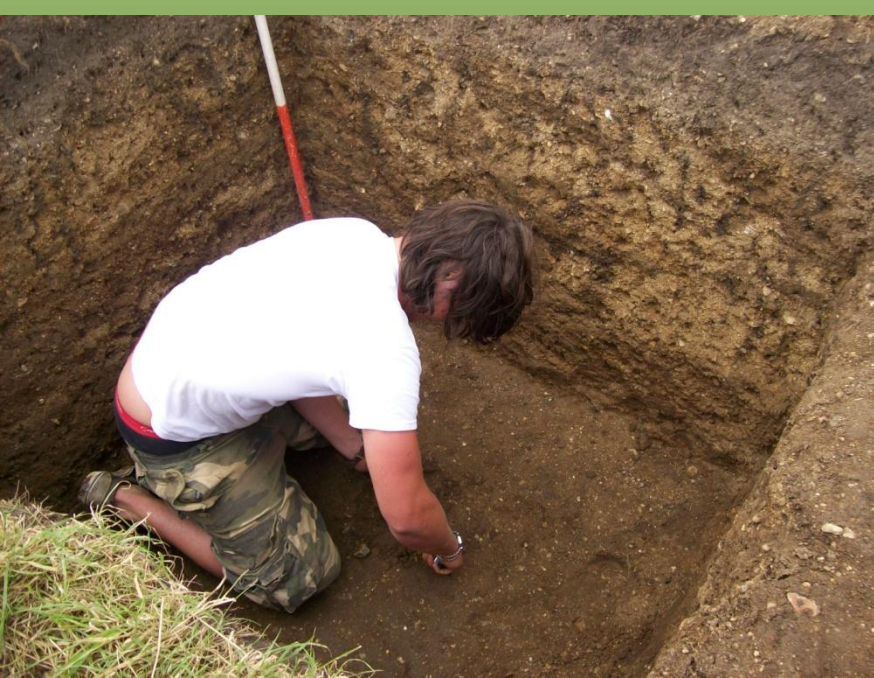
One of several test pits.