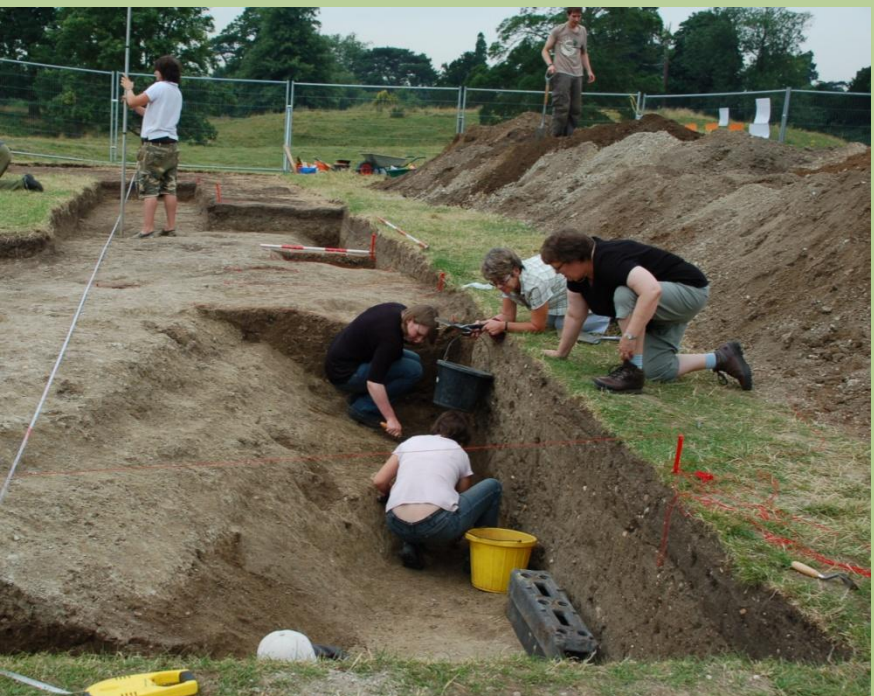
Finding the base of the ditch.