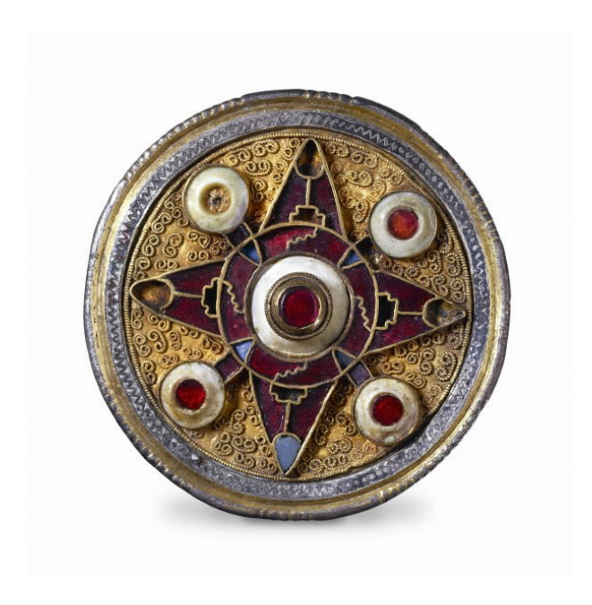
Plated disc brooch Kent, England Late 6th or early 7th century AD