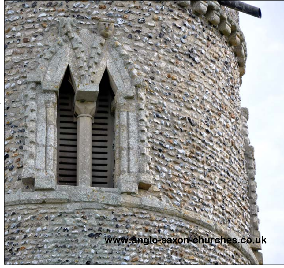
File created 09/2010

2. Haddiscoe church, Norfolk. Belfry window Nth, (one of four). Note triangular heads and with surrounding strip-work enriched with billet ornament. The Anglo-Saxon characteristic where the through stone is supported on a central shaft, but here with attendant billet decoration, gives an indication of the influence of Continental-Romanesque practise. Perhaps dating to before 1050.