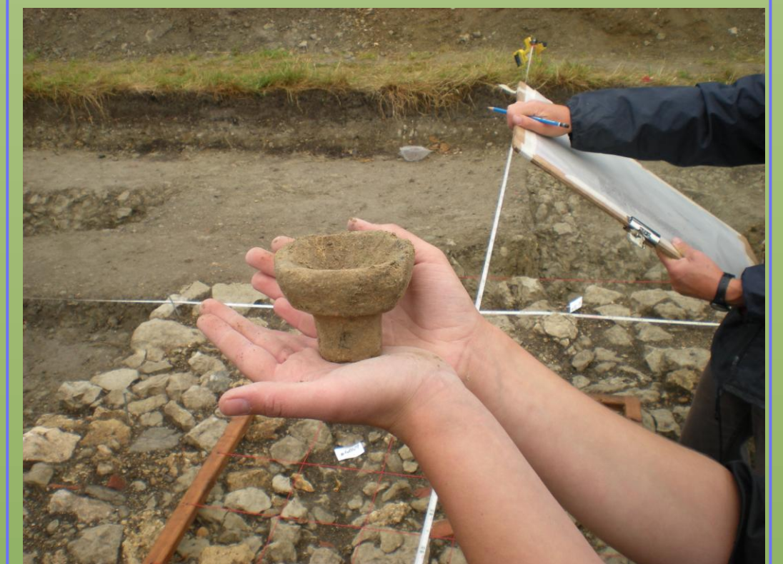
A carved stone object, thought to be a lamp.

A dense medieval archaeology was revealed, with stone wall foundations and robber trenches indicating the positions of former buildings. The earliest feature was a small 12 th century oven. Most of the walls dated to the 13 th century or later. Overlying the archaeological stratigraphy was a demolition layer rich in pottery, roof and floor tiles, and other finds.