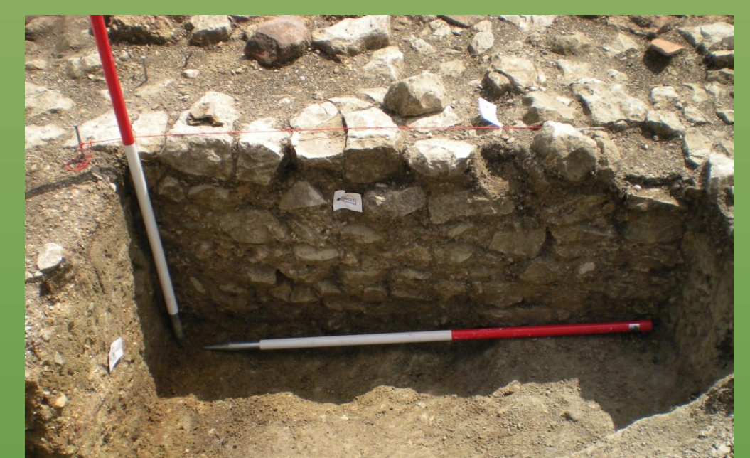
This wall has six or seven surviving courses.