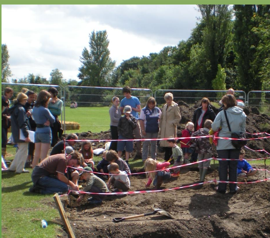
Children's excavation, Open Day.