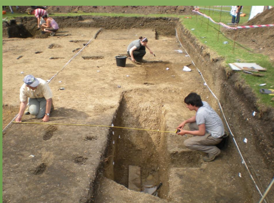
Recording a large pit, situated at the back of the buildings.