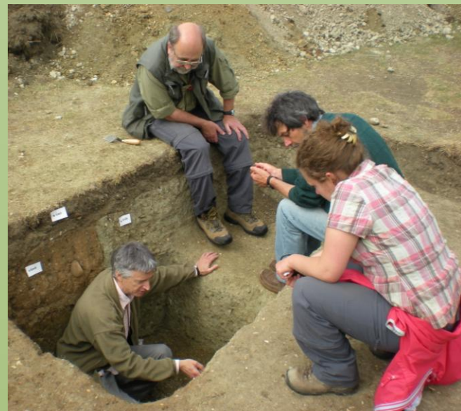
Geologists join the team to help interpret evidence.

A geophysical survey had shown a linear feature crossing the school playing fields from north to south. Excavation revealed an orange band of compacted gravel about 3m wide, with flanking ditches either side. This was a medieval road, dated to the 12 th -13 th centuries, which once joined up with Castle Street to the south. Other intriguing features were a huge marl-filled quarry pit next to the road, and an earlier road surface, underlying the first.