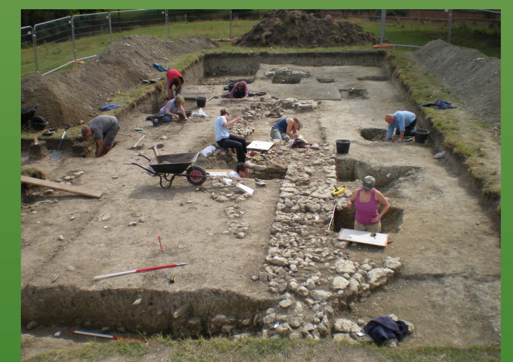
An overview of the trench, with excavation in progress.

The 2008-2010 Project is funded by the Arts and Humanities Research Council and is a joint academic venture between the archaeology departments of the Universities of Leicester, Exeter and Oxford. The project is run in collaboration with Wallingford Museum and The Wallingford Historical and Archaeological Society (TWHAS), and is supported by Wallingford Town Council, South Oxfordshire District Council, Oxfordshire County Archaeology Service, English Heritage, the Northmoor Trust, the Ashmolean Museum and Reading Museum.