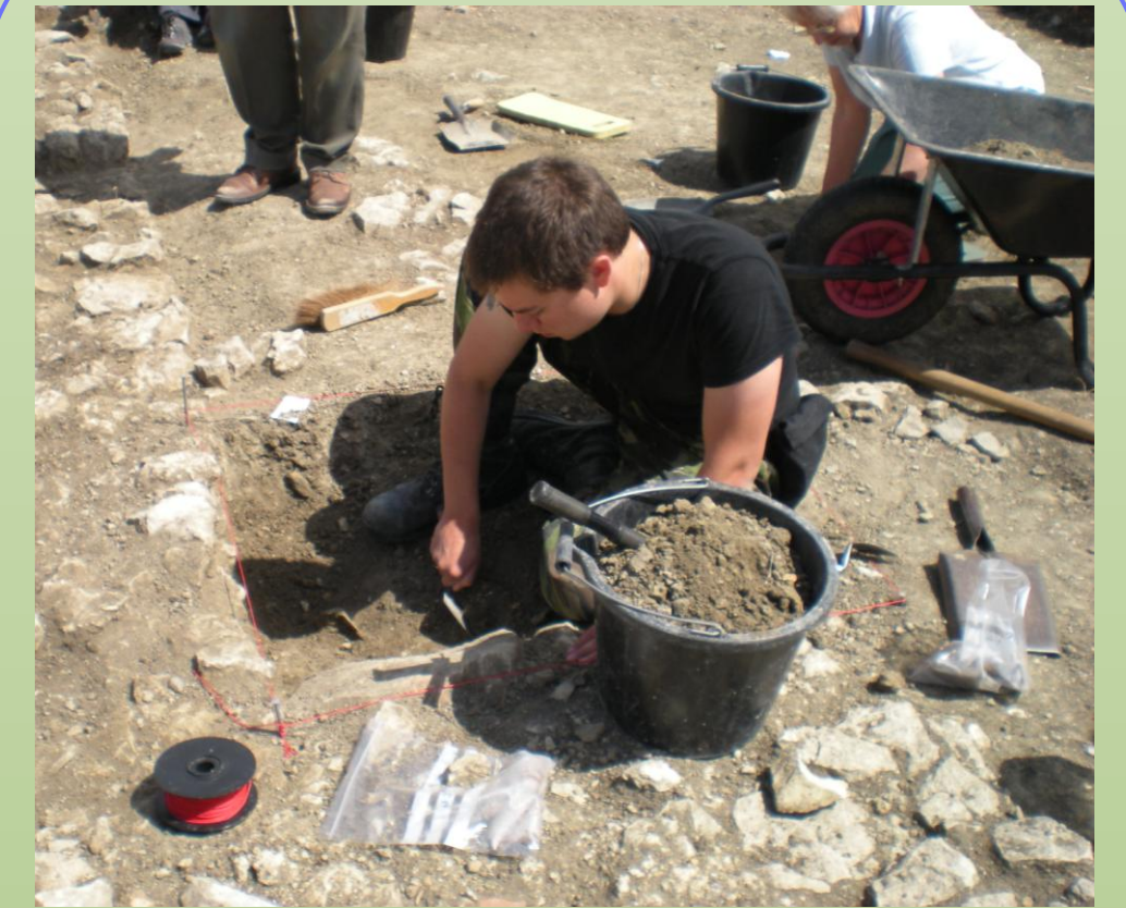
Discovering medieval walls.

Following on from the successful excavations in 2008, three further trenches were opened in the summer of 2009. These were positioned to pick up features detected by geophysical survey earlier in the year. Archaeologists and students from the Universities of Leicester and Exeter dug alongside local workers from Wallingford Museum. The digs were visited by hundreds of people over the course of the three week period. All the trenches produced evidence from the 12 th -13 th centuries.