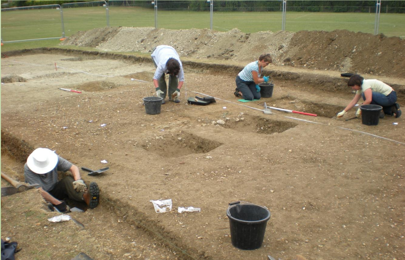
The two workers in the background are trowelling the surface of the road, with those in the foreground digging the easternmost flanking ditch.