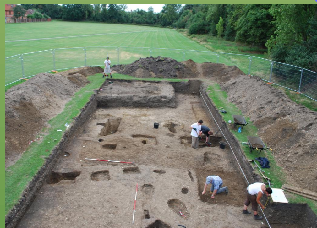
Aerial view of the excavation, looking south.