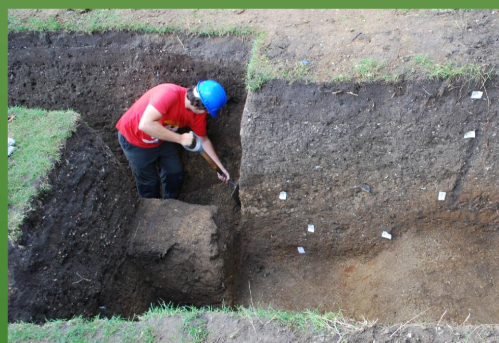
Extension trench, showing internal ditch and bank in vertical section.